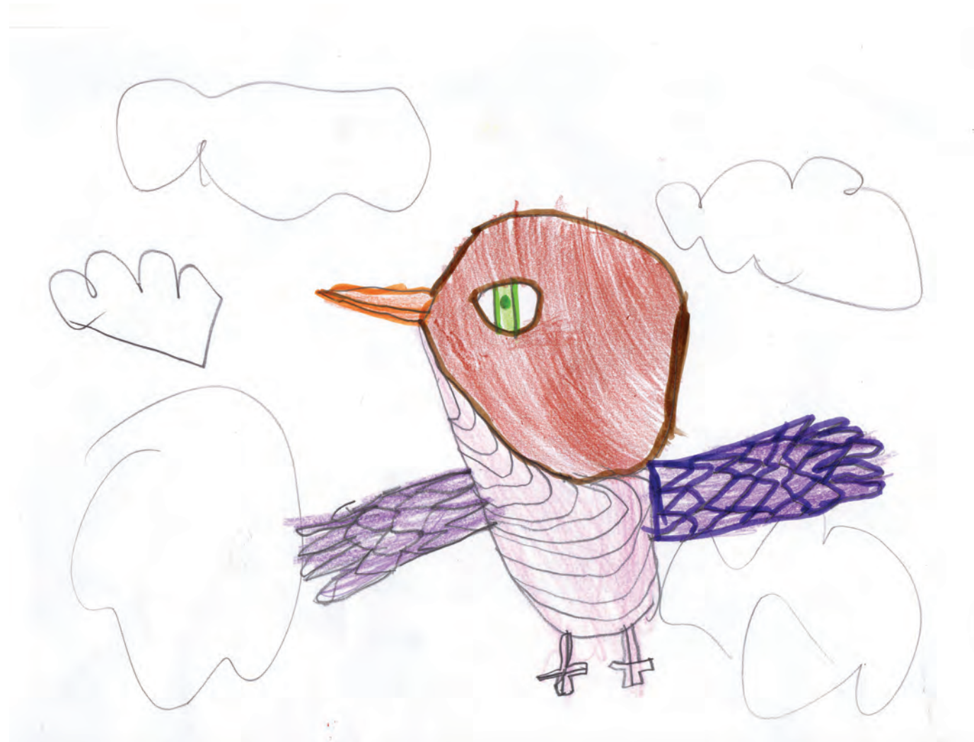
The Kookaburra of Delacombe